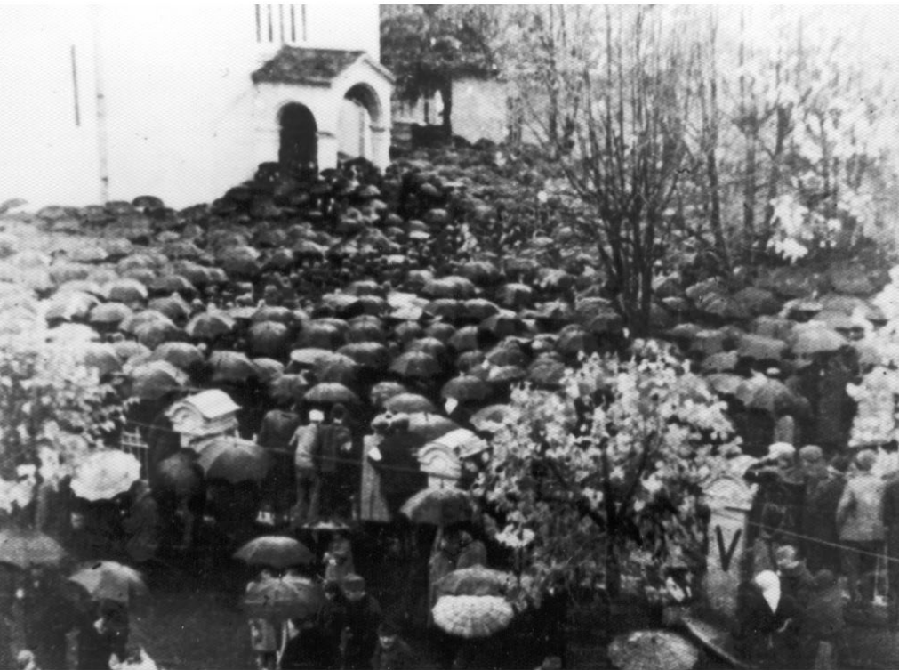
A memorial service in the courtyard of the New Church in Kragujevac on October 21st, 1942

However, despite the ban, people found a way to mark the graves of those executed. "Everyone who had someone close to him perish in the mass slaughter wanted to find solace in having a grave they could consider a resting place. All the gravesites are bordered off with crosses, embellished with names and pictures. There are candles, tables, and benches everywhere. These are now entire cemeteries. It's just that they're very unusual cemeteries. Located 100, 150 to 250 meters apart, arranged in such a way that a person can encompass more than ten of them with a single glance." 146