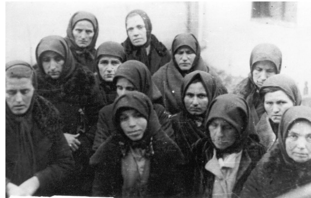
In the bread queue in 1942.

Analysis of the locations where the executed people were arrested yields interesting data. We have reliable information on how many people the Germans had custody of before the arrests of October 18 th and the mass arrests of October 20 th . There were 53 people being