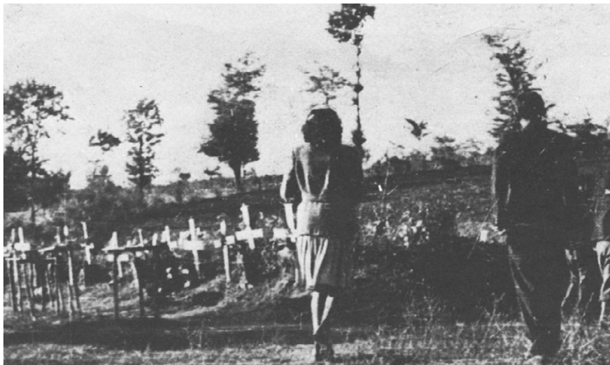
Mass grave of the executed

dozens of cases where mothers and wives, both alone or with neighbors helping them, took the bodies of their husbands and sons from the killing sites and buried them in the cemetery.