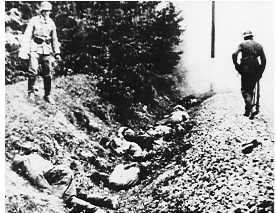
Group of those executed