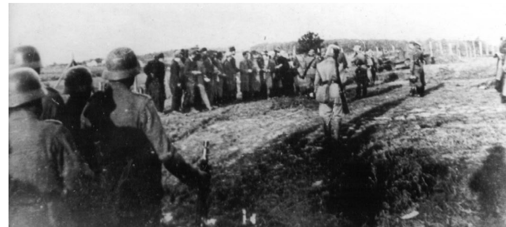
Figure: Confiscation of personal documents at the entrance to the artillery sheds.