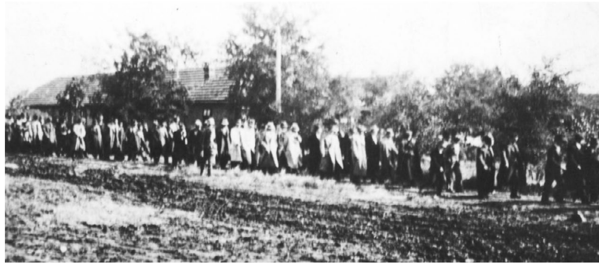
Figure: Civilians being led off to be executed