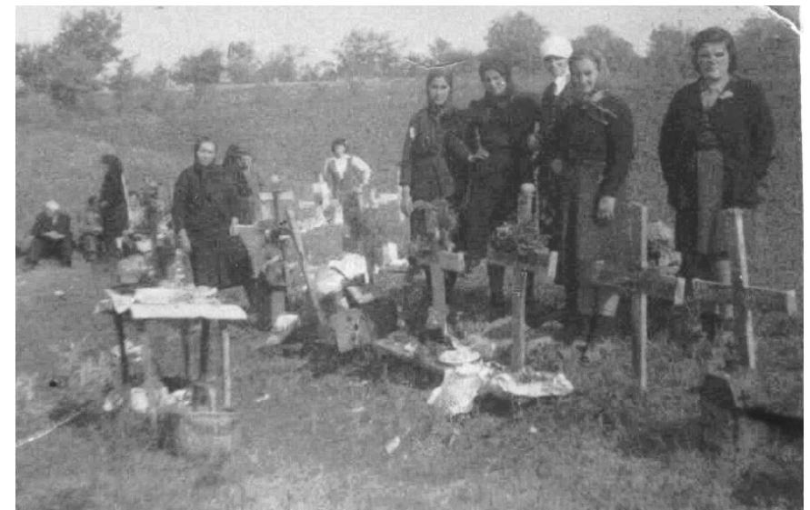
A memorial service at a mass grave during the war

Knowing Serbian customs, General Franz Böhme, in his order of October 10 th , prohibited the graves from being marked in any way: “When burying those executed, you must ensure that no Serbian shrines (places of pilgrimage) are established. Placing crosses on the graves, decorating them, and so on, should be prevented...” 145